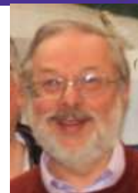
Table Talk is focussed on reporting "timetable" news. "Related" news, however, is a flexible concept, reflecting, to some extent, the Editor's interests. At present, therefore, there are related infrastructure and political items.

In 2015-2016 Table Talk , ATA's news magazine, continued its successful reporting of timetable and related news about railways in Australasia. The biggest and longest lasting issue reported was V/Line's operational problems. We know that Table Talk's reporting of the disappearance of V/Line's Working Timetable from their website, contrary to an obligation to the Victorian Essential Services Commission, had a role in the restoration of that information to the website.