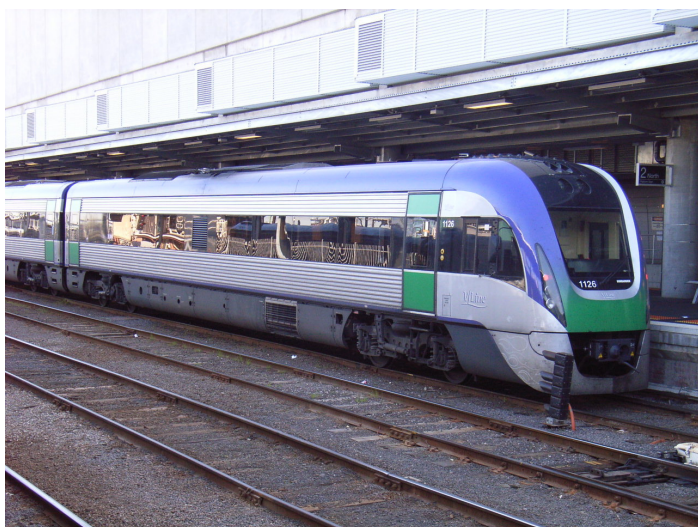
VLocity set no. 26 at Southern Cross on 28 September 2006 (Steven Haby)

In a departure from the norm, Pacific National has now placed all their WTT and associated documentation on their website See page 5.