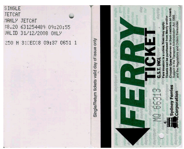
Ticket for the final service

As foreshadowed in December Table Talk , the Manly Jet-cat services ended with the departure of the 1000 service from Manly to Circular Quay on New Year's Eve, 2008. This service was run by the Bluefin , with the preceding service run by Sea Eagle . As the incoming Bluefin and outgoing Sea Eagle passed off Little Manly, they performed a pirouette for the benefit of the media helicopters and did so again at Circular Quay. About 80 people, including about 20 media