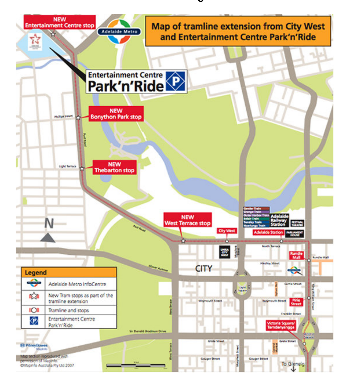
Adelaide's new Tramway – pages 8-9

No. 212, April 2010 ISBN 1038-3697 RRP $2.95 Published by the Australian Association of Timetable Collectors www.aattc.org.au