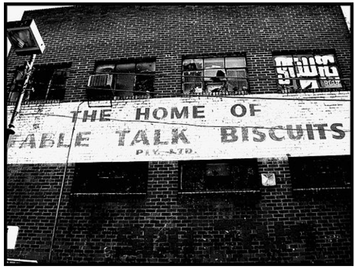
Prahran, Victoria