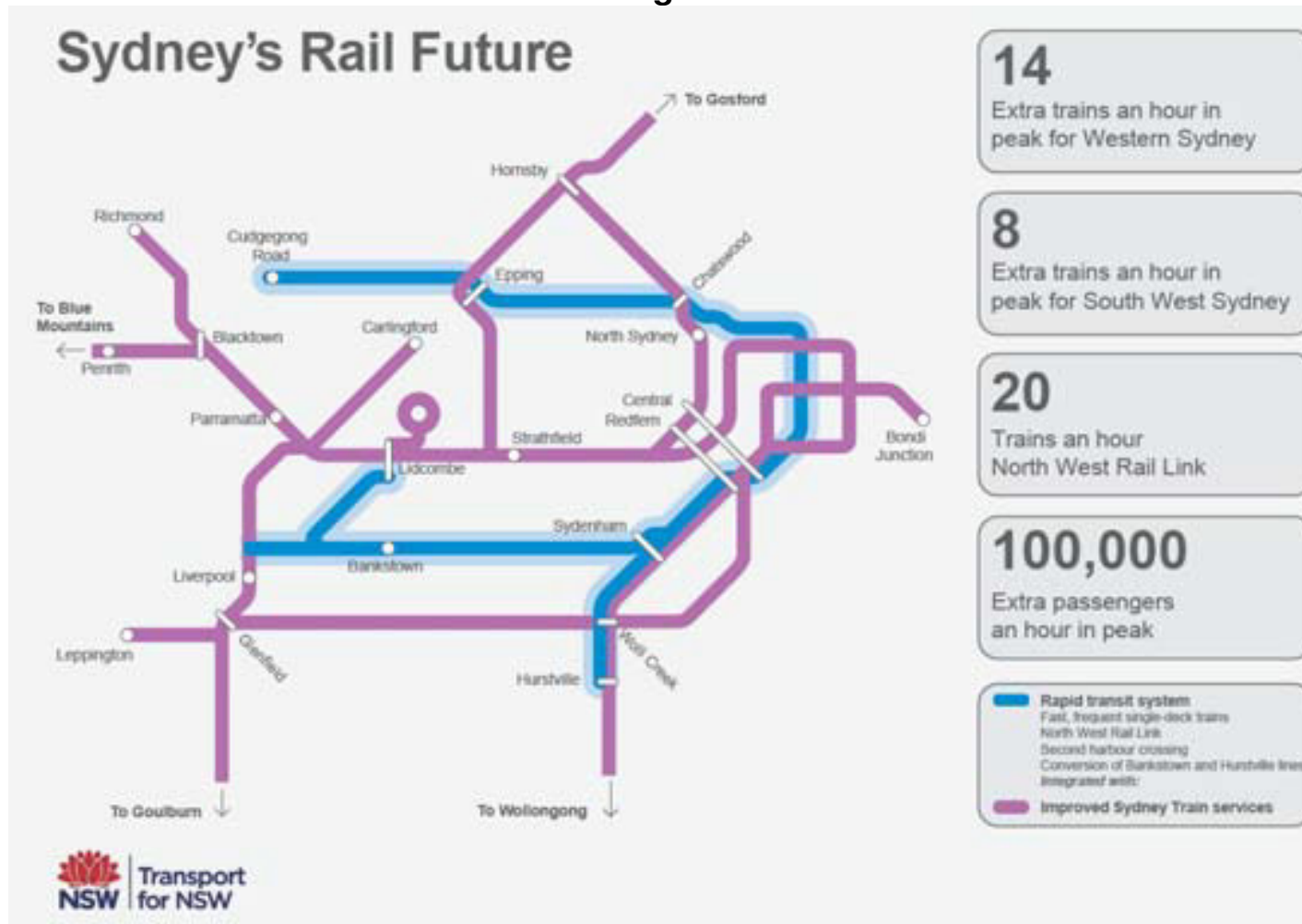
Graphic from the Premier's and Minister's "Sydney's Rail Future" announcement, 20 June 2012. The differentiation between the proposed "Rapid transit system" and "Improved Sydney Train services" may not be clear in black and white. The "Rapid transit system", ie, frequent single-deck trains, are the fuzzier lines to Cudgegong Road (NW line) Hurstville, Lidcombe via Bankstown and Liverpool via Bankstown.