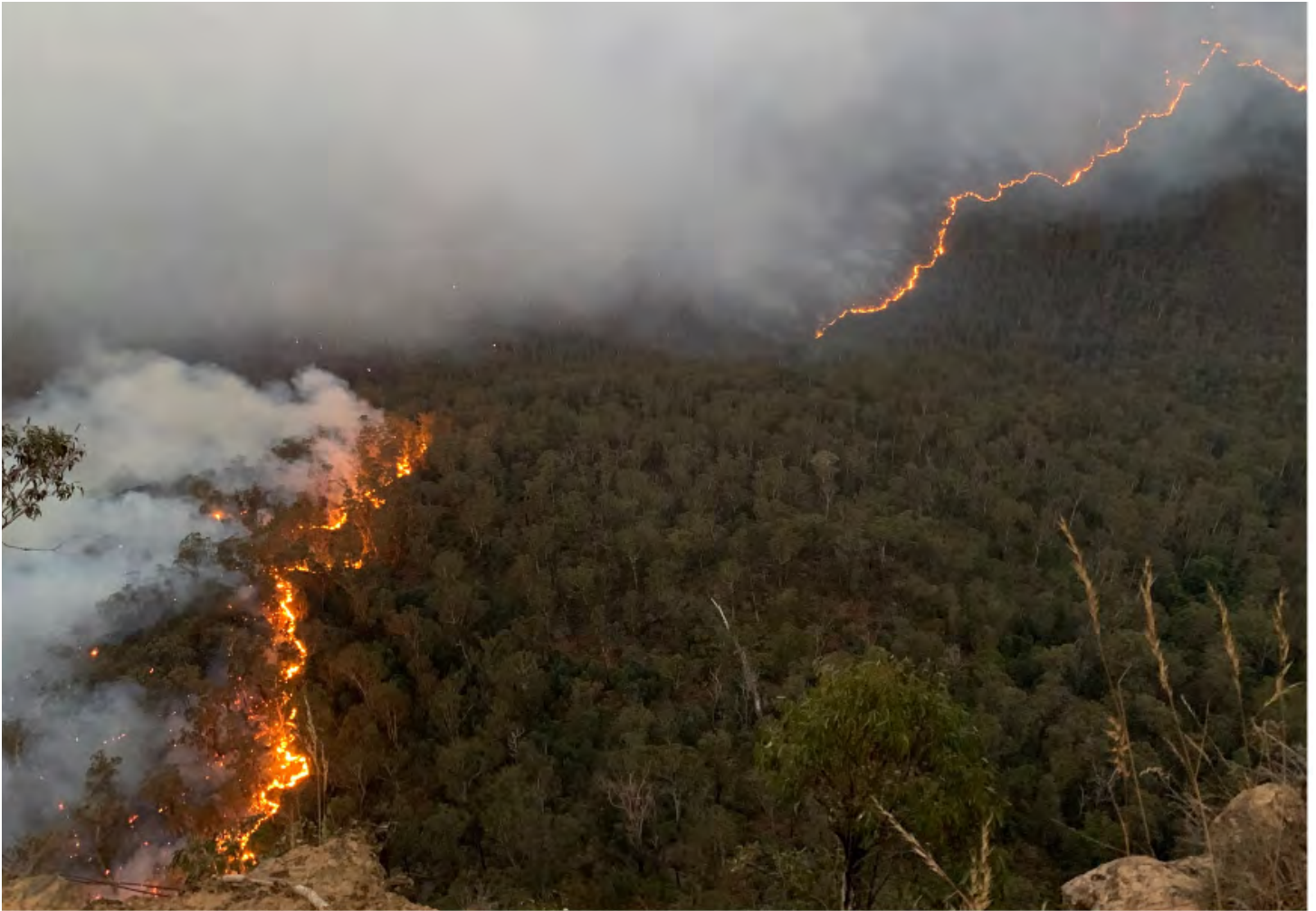
Grose Valley fire front on 19 December.