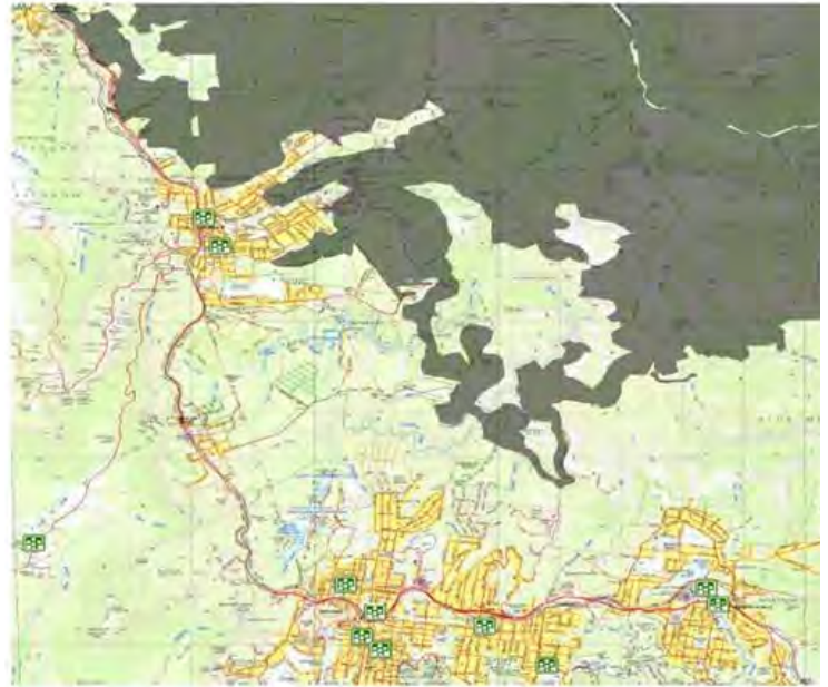
Below: Grose Valley fire at 26 December. Mount Victoria located very top-left corner of picture, Blackheath mid-left, and both Katoomba and Leura bottom.

The Southern Highlands Line also experienced disruptions in late December as a result of bushfires between Campbelltown and Goulburn. The line is currently operating normally.