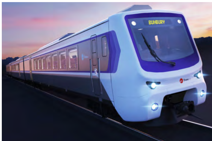
Table Talk – February 2020

The design for the two new Alstom-built three-carriage Australind train sets was revealed on 24 January by the West Australian government. The train will include a buffet, bike spaces, Wi-Fi, USB connection ports and toilets.