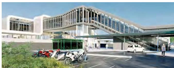
New Midland station design.

There is no timeframe for the promised Midland line extension.