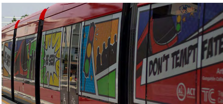
CMET light rail vehicle with AOA safety messaging.