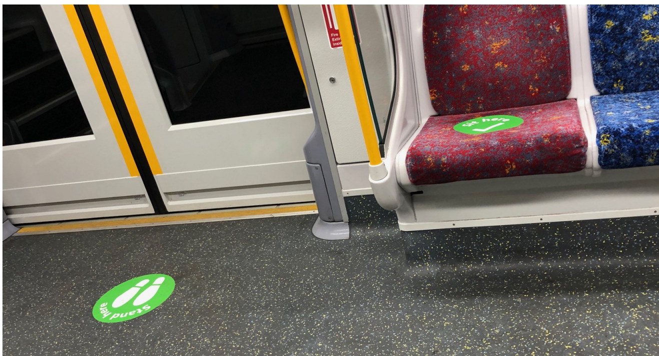
Green “stand here” (left) and “sit here” (right) dots inside a Sydney train.

In late April, the state government also announced it was spending $250 million across public transport and schools as part of its first line of defence against COVID-19 transmission. The Premier said the package “supports jobs and businesses, importantly it will give the public the peace of mind”, improve “hygiene across the state” and provides “a much-needed social and economic boost”. The state Treasurer said that over 550 re-deployed and new contract cleaners had been deployed with the state on track to have 3,000 full-time cleaners on board by the end of June. The state Transport Minister, Andrew Constance, said that since March, 83,000 additional cleaning hours had been racked up.