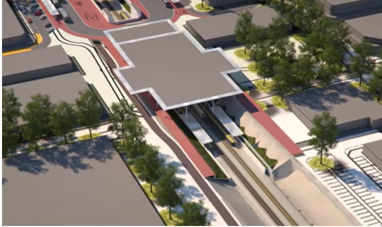
Alkimos early design.