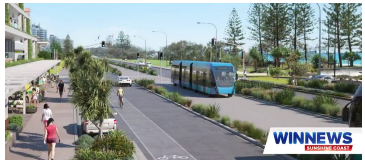
A look at Option 2.

The project is now undergoing an 'Options Analysis'.