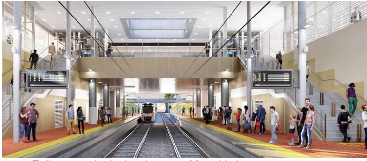
Eglinton early design.