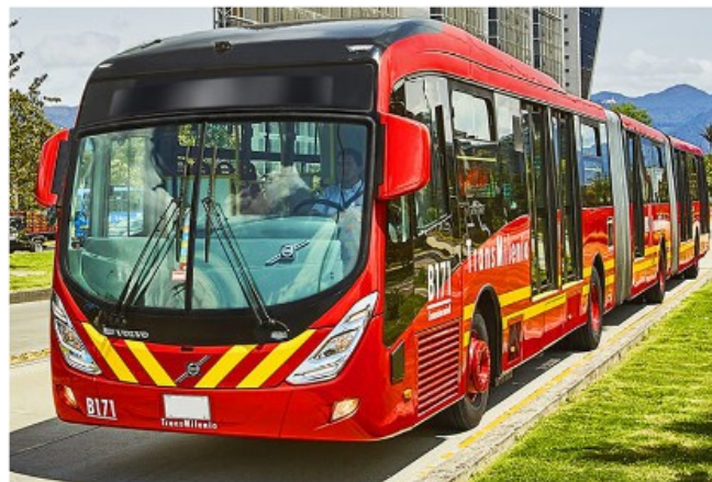
TransMilenio BRT bus

Auckland Transport has said it could take up to a year for Thales to make the plan workable. STUFF.CO.NZ