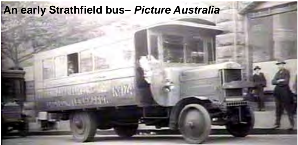
An early Strathfield bus